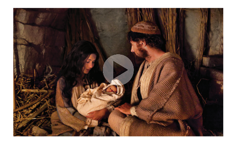
Discover The Gift

Visit christmas.mormon.org (launching November 28) to find inspiring materials to share. The Christmas season provides natural opportunities to help others discover the gift of Jesus Christ. As you visit the site, prayerfully identify ways you can #ShareTheGift that may lead others to accept invitations to learn more about the restored gospel with the full-time missionaries.