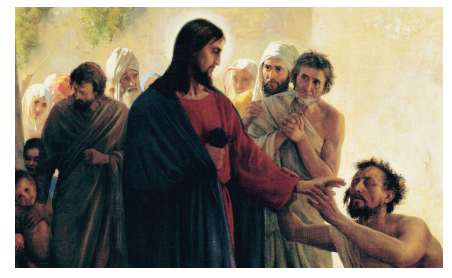
Embrace The Gift